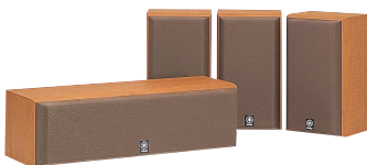
NS-P70 Center and Surround Speaker Package