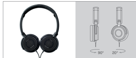
Earpieces can be rotated inside 20° and outside 90°

The adjustable earpieces not only perfectly match the shape of your head, they swivel to a flat position for easy storage and carrying. The size of the headband can also be adjusted, ensuring a comfortable fit.