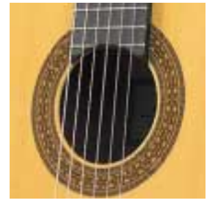
CG201S Hole Design